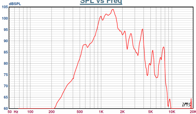
Sound pressure levels at 1W/1m SPL vs Freq